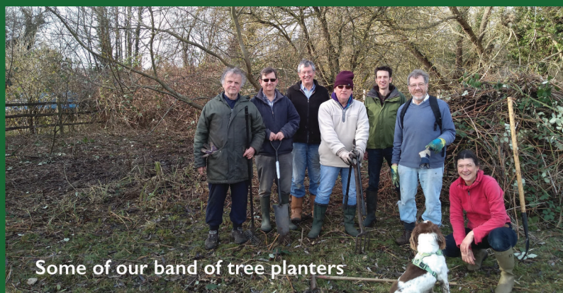
Some of our band of tree planters

Over 25 trees were planted to replace those lost to animal damage (squirrels, rabbits and muntjac). Hopefully we will be able to keep them away this time. The welfare of the trees on Wolvercote Green, Wolvercote Common and Goose Green comes under the care of the Commoners' Committee and the work continues on our next work-day (9 th March),