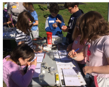
Young explorers identify and draw their finds

After not too long an extensive collection of spiders were found in the surroundings and brought back for closer examination by the keen explorers. They all had special containers with magnifying glass lids.