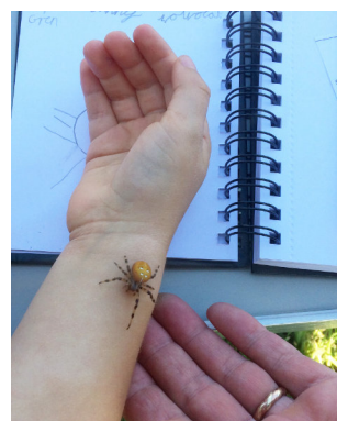
Elsa Tudor-Jones, gets close-up and friendly with a 4 spotted Orb spider

Some, however, wanted a more close-up and hands-on approach (under the expert direction of Lawrence). The Explorers meet every month in different locations, usually with an expert on hand, and discover many amazing facts about the flora and fauna to be found in the area. Wolvercote Green is perfect for exploring as it has such a variety of plants and insects during all the seasons.