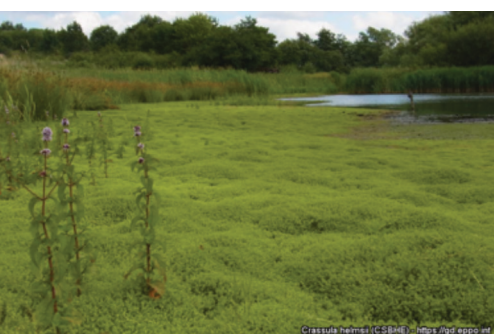
A pond completely overrun with untreated Crassula helmsii

Some of you may have seen a person out on Wolvercote Common by the Jubilee Gate wielding a rather ominous looking flame thrower. This was just one of our volunteer helpers during the September work-day when we were trying, yet again, to eradicate an invasive plant called Crassula helmsii , (or Australian Swamp Weed to you and me). If allowed to grow unimpeded the weed is capable of completely taking over all the natural habitat found in the wetter areas.