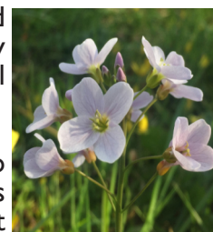
Recently added: Lady's smock/cuckoo flower

We can then identify it and add it to the site. We've added three plants this month, so let's try and make it the go-to site for plant identification.